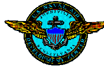
Test Pilot NADC JOHNSVILLE