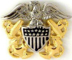
US NAVAL OFFICER