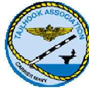
U.S. NAVY TAILHOOK