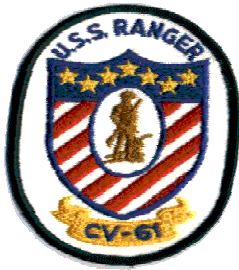
USS RANGER 35