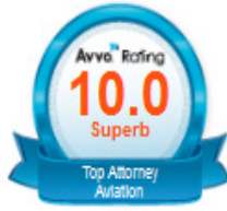
AVVO 10.0 superb