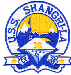
USS SHANGRI LA