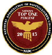
NADC TOP 1%