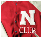
VARSITY LETTER NEBRASKA 61-63