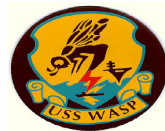
USS WASP 20