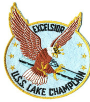
USS LAKE CHAMPLAIN 25